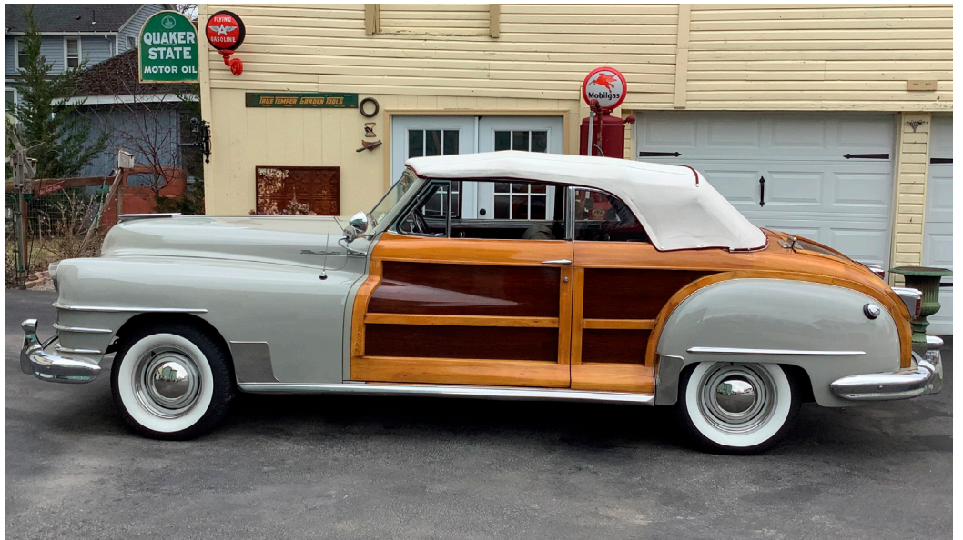
2025 Best MOPAR / Dave & Jan Coon 1948 Chrysler Town & Country

Refreshments: Breakfast Sandwiches & Juice starting @ 6a.m. - Chicken BBQ etc. Trophies Donated by Area Merchants • 50/50 Raffle • Large Flea Market